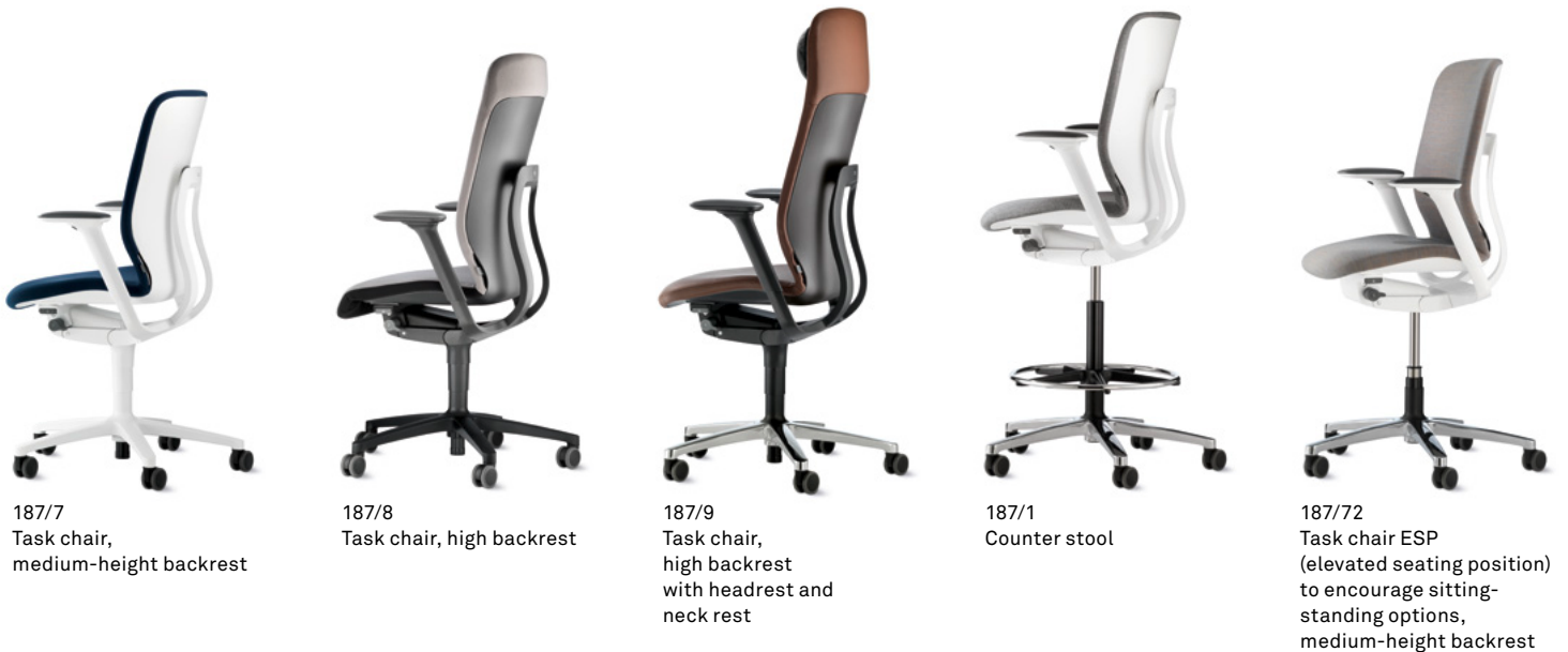
187/7 Task chair, medium-height backrest

The height of the armrests is adjustable by 3.9" at the touch of a button. The depth of the armrest pads on 3D armrests can also be extended by 2" and the width by 1", 4D armrests can also rotate inwards and outwards by 25°.