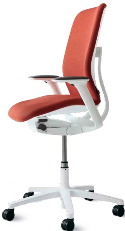
AT task chair 187/72 Medium-height backrest Elevated seating position (ESP)

And this is exactly where the free-to-move models with elevated sitting positions (ESP) come in. They can be used at normal desk heights as office chairs with full 3D ranges of motion but also be raised to a sitting height of more than 60 cm. The elevated sitting position also provides new additional features: if the seat is tilted forward,