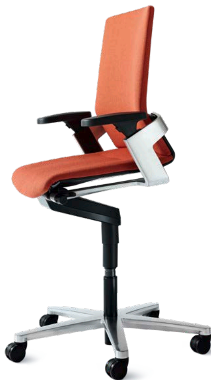
ON® task chair 174/72 Medium-height backrest Elevated seating position (ESP)