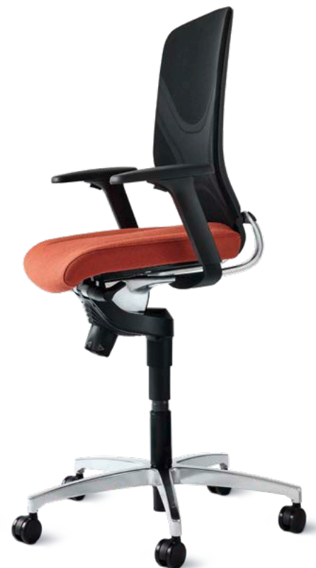
IN task chair 184/72 Medium-height backrest Elevated seating position (ESP)