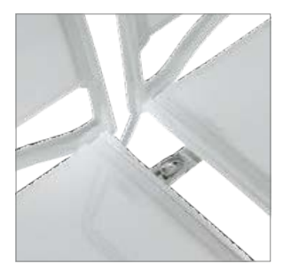
Simplicity itself and available as an accessory for the multipurpose chair is the automatic shot-blasted, matt chromeplated, flat-profile steel connector. To use, just open out and insert the next chair that's all there is to it.