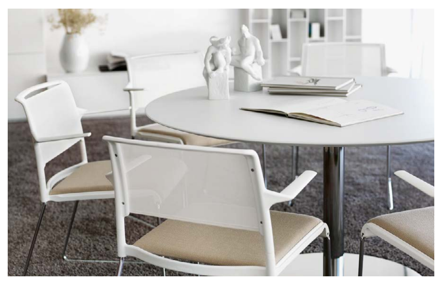
Types with seat shells and upholstered covers are available should firmer cushioning be required. As a result, there's more scope for colour combinations as well. These models are also stackable (to a maximum of ten) and optionally fitted with extra bumpers to protect the seat underneath.