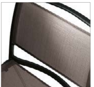
Exclusively for black seat and back frames: The two-tone covers in silver-black and copper-black make it easier to coordinate different