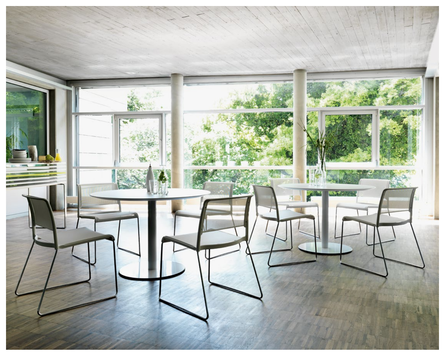
Round Aline tables, single pedestal, large formats

We offer models with table top diameters of 90 to 140 cm (353/8" to 551/8") for bigger discussions, meetings or family parties. Up to eight people can sit here comfortably. The 25 mm (1") thick MDF boards are black or white powder coated, the disc base and pedestal are made to match, optionally with a reflecting stainless steel cover and bright chromium-plated table pedestal.