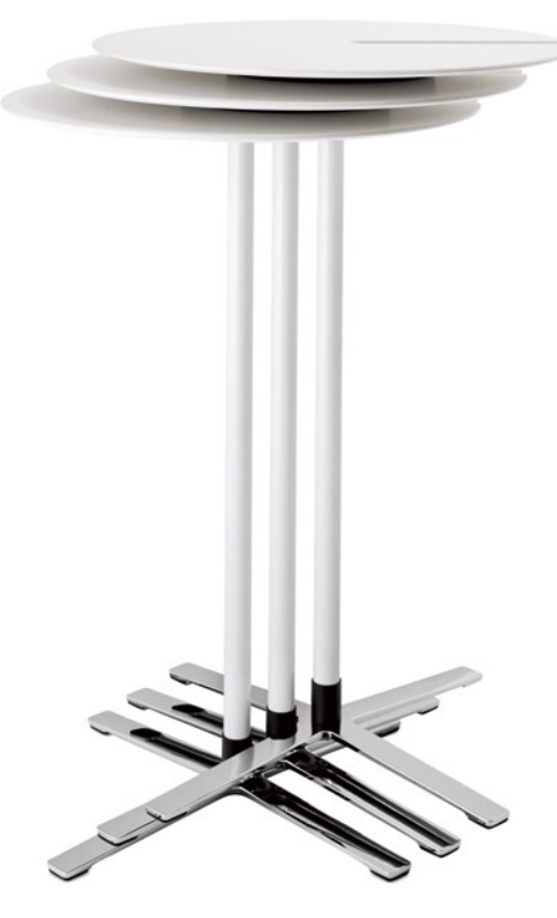
Model 236/3 Top marks for practicality: the square and circular top high tables are optionally available with slots in the tabletop, allowing space-saving stacking of up to three standing tables.