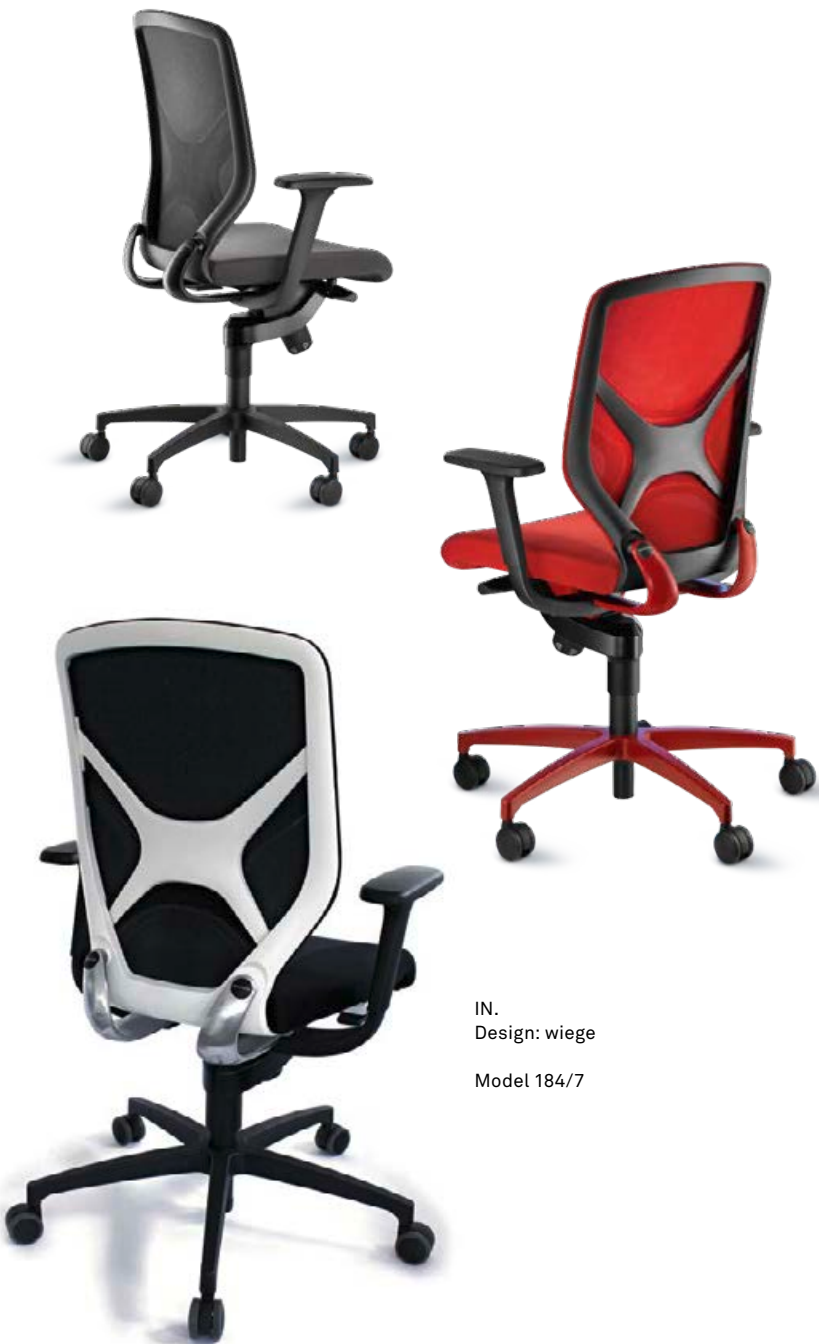
IN. Design: wiege Model 184/7

The IN office chair is considered the most dynamic and also the most comfortable office chair. It stimulates body and mind while providing extreme comfort at the same time. The two swivel arms move independently from one another and interact seamlessly with the black or white seat and back shell, made of state-of-the-art two-component technology. The soft 3D Formstrick cover completes the package.