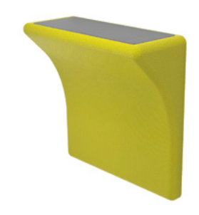
208/2 Projecting element with shelf 60 \times 60 cm (235/8" x 235/8"), depth 23 cm (91/16")