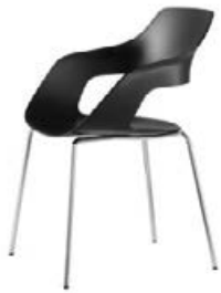
222/10 Multipurpose chair ☐ 44 ☐ 82 ☐ 57 ☐ 58

Occo's forte is its diverse range of models for different scenarios with the same design language throughout. Four frames, three types of cushioning and six shell colours produce a total of 72 variants which, along with different table shapes and table tops, respond to virtually all functional and design requirements. Occo is at home in canteens to informal places for meet-ups to high-quality conference rooms. The seat shell and its characteristic cut-out section at the back, plus the different material thicknesses, ensure unusual comfort. With the four-leg chrome-plated metal frame up to ten of them can even be stacked on top of one another.