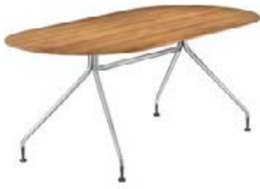
222 range, table