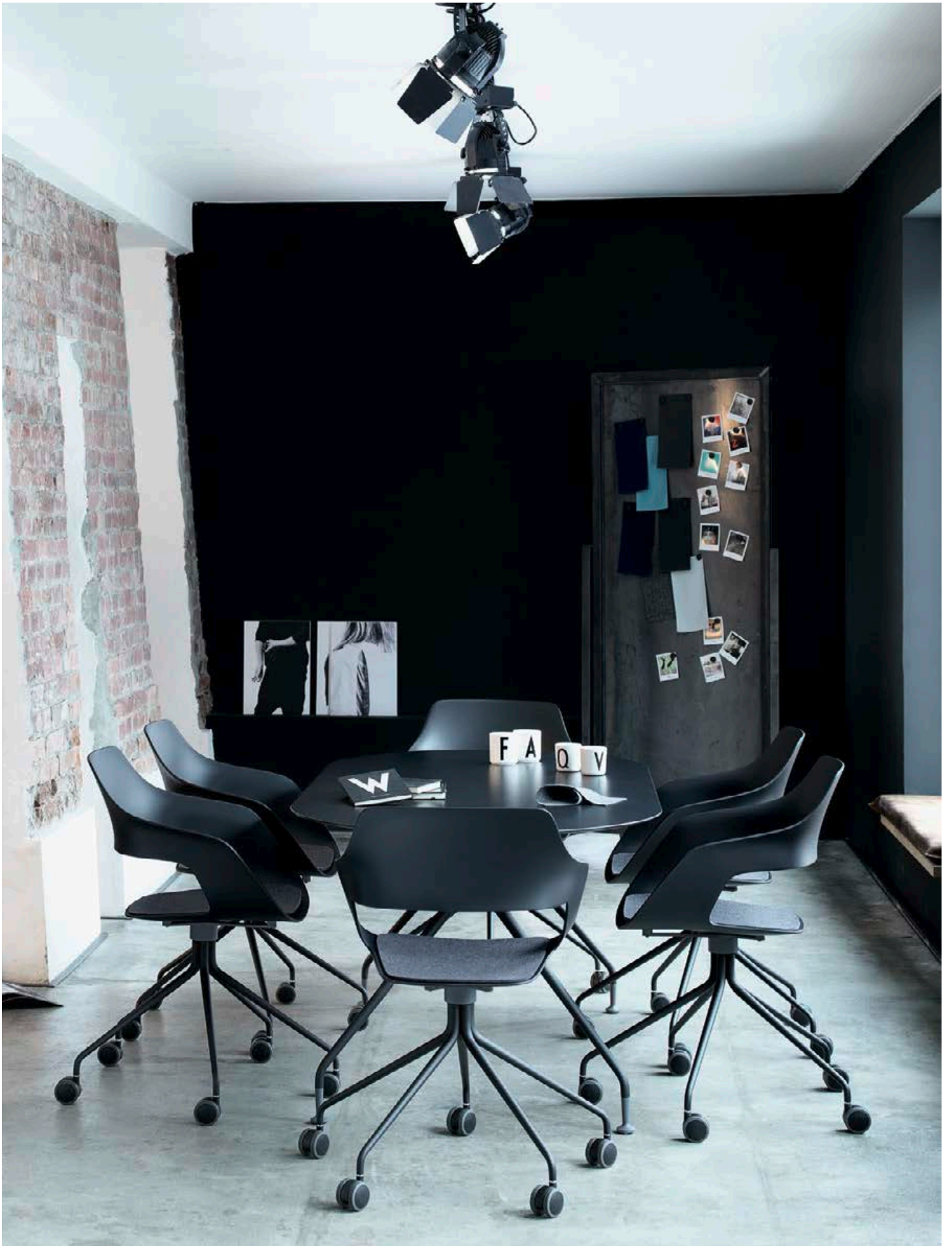
Occo chairs and tables for seamless solutions, where colour and function match the room's atmosphere.