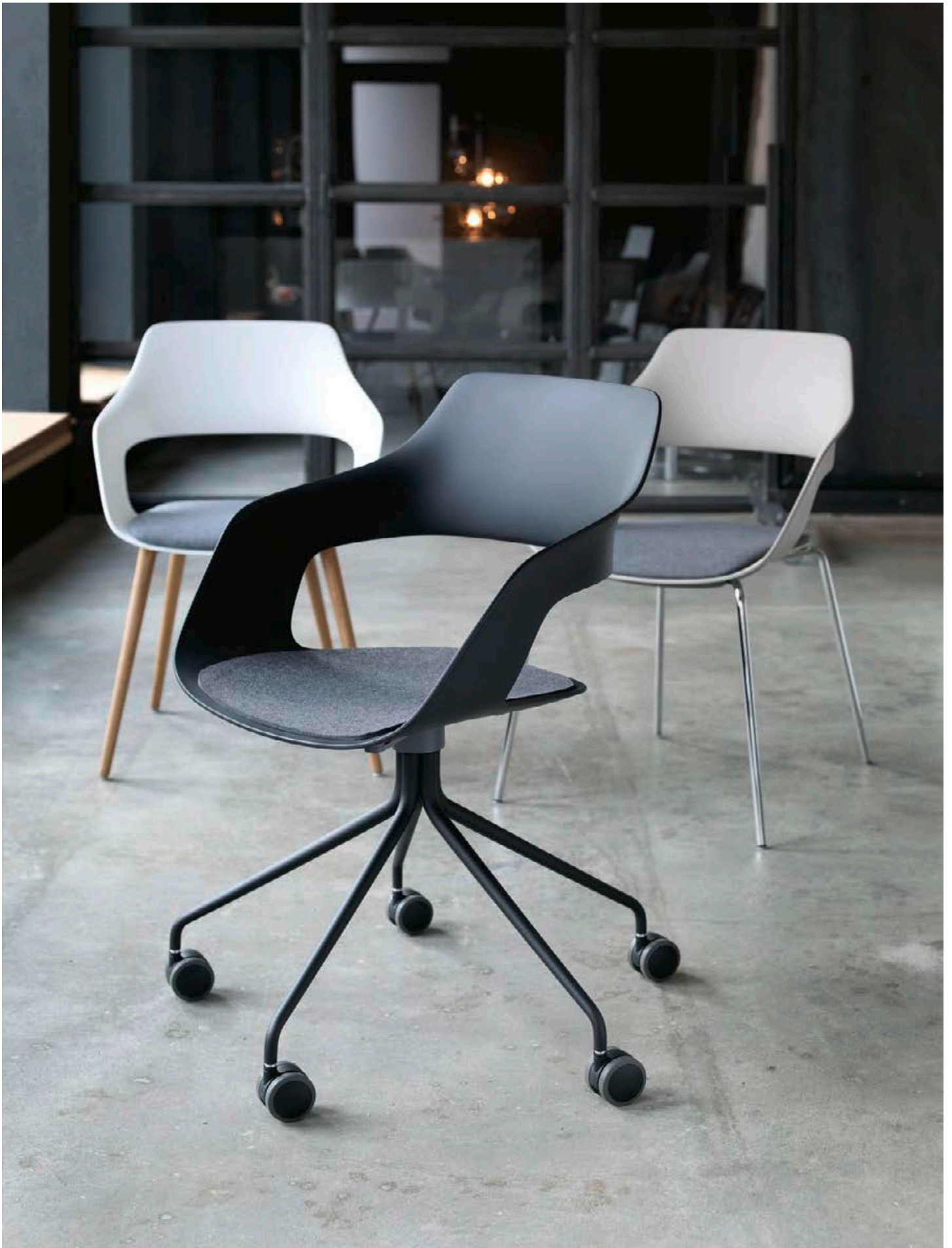
Whether in a four-leg or star-base version – the characteristic seat shell is the common denominator of all the many designs.