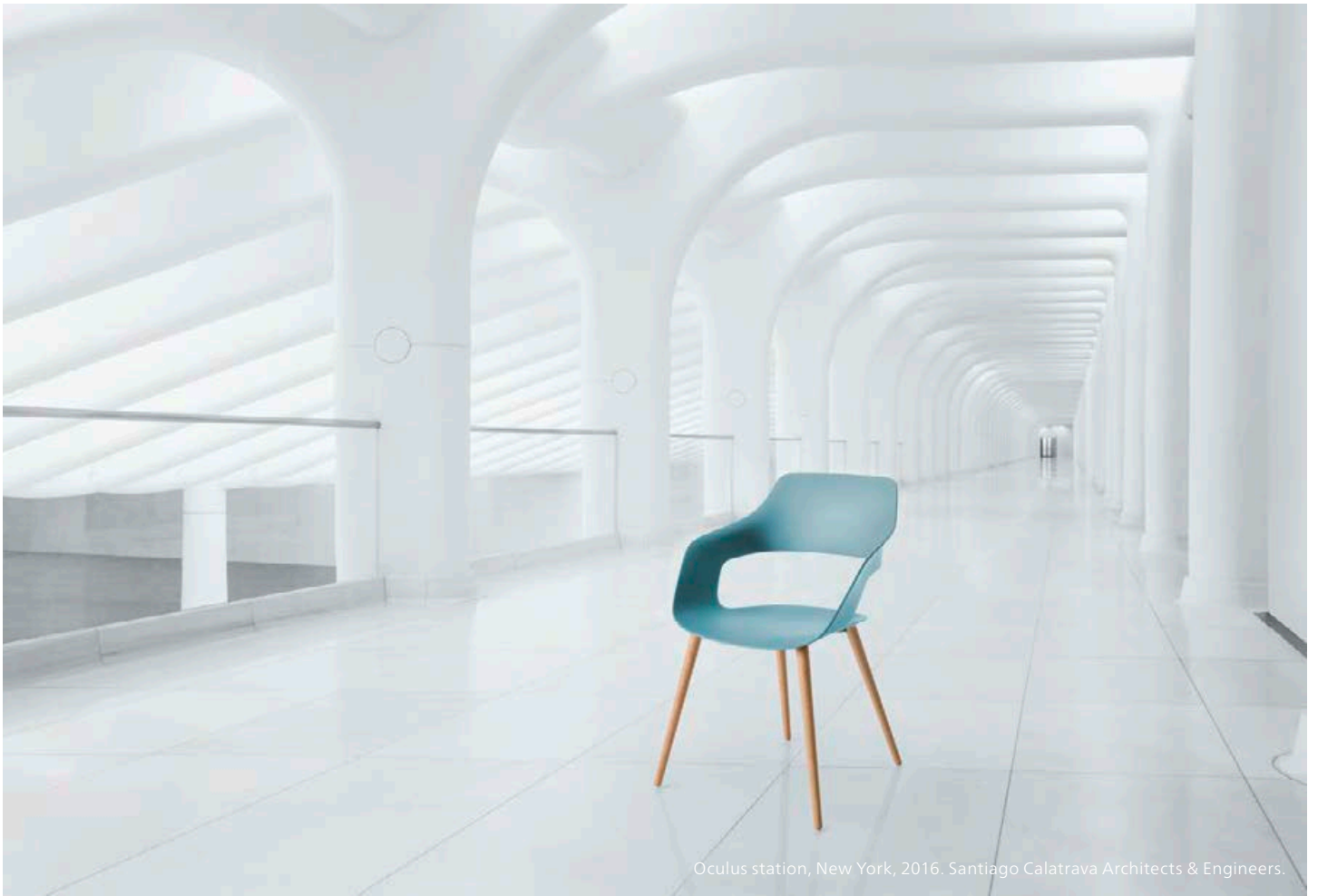
Oculus station, New York, 2016. Santiago Calatrava Architects & Engineers.