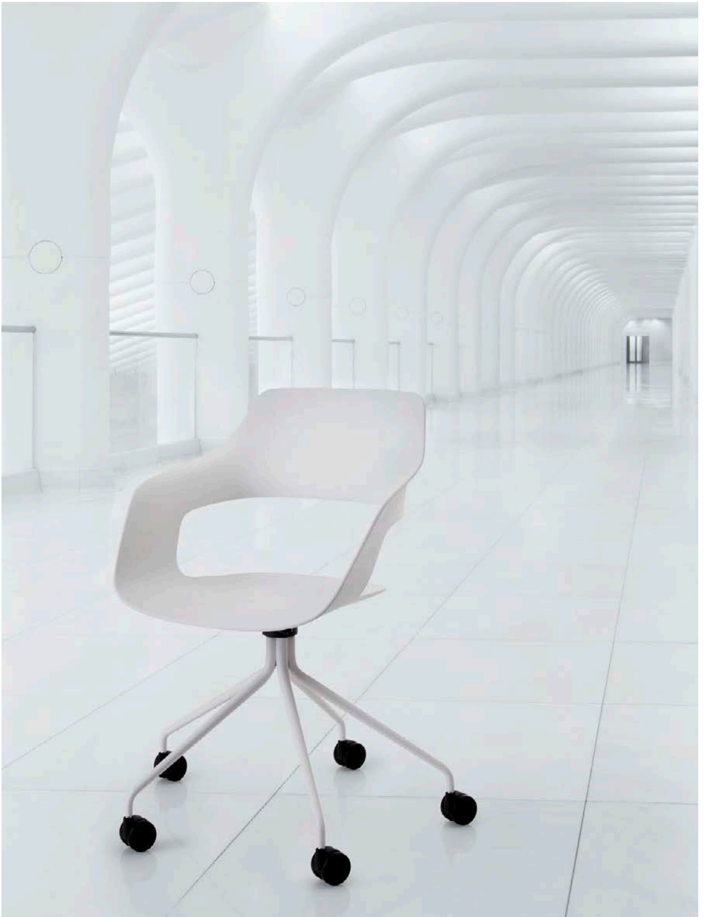
Oculus station, New York, 2016. Architect: Santiago Calatrava Architects & Engineers. Occo chair: stylish, refreshing and diverse.