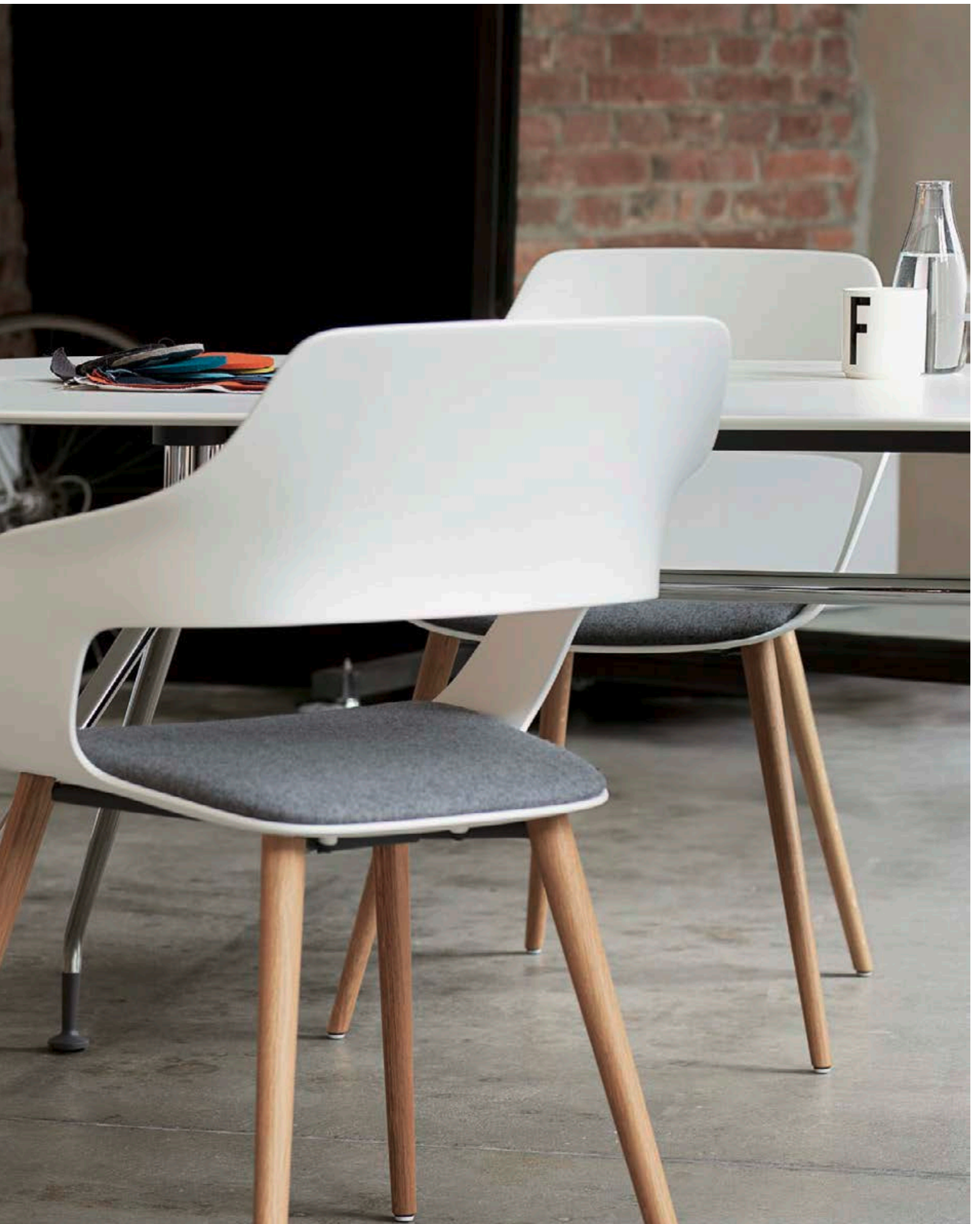
A range of design options: e.g. with a solid-oak frame for a warm, home-like appeal in industrial lofts.