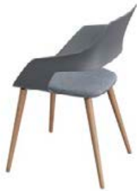
222/20 Multipurpose chair ☐ 44 ☐ 82 ☐ 57 ☐ 55