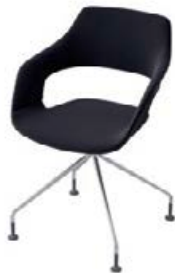
222/32 Multipurpose chair