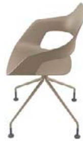
222/30 Multipurpose chair ☐ 43 ☐ 83 ☐ 58 ☐ 56