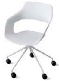
222/40 Multipurpose chair ☐ 43 ☐ 83 ☐ 58 ☐ 56