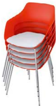
222/11 Multipurpose chair up to ten stackable without cushioning, up to six stackable with cushioning