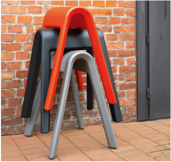
Even stacked at right angles, the Sitzbock pommel horse seats are eye-catchers that invite people to stop and talk to each other.